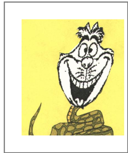
Figure 1 The Wheedler

5. Our thoughts can reflect a Wheedler view . The Wheedler is a fictional character who connives and cons in different disguises. Here is a Whiny Wheedler procrastination line of thought: "Don't do it." "You will make yourself feel bad." "This is too much for you to do." "You are going to be overwhelmed." Your Reactance Wheedler tells you: "You shouldn't have to do this. It's a waste of your valuable time." Here is an Easygoing Wheedler line of thought: "Take it easy. No need to rush. You have better things to do with your time." You can contest Wheedler thinking in whatever disguise it appears. You can ask, for example, what does "don't rush" mean? How does this "don't rush" instruction apply to this situation? Then refuse to accept any lame excuse you may give yourself as to why a needless delay is okay. That is one way to Beat the Wheedler .